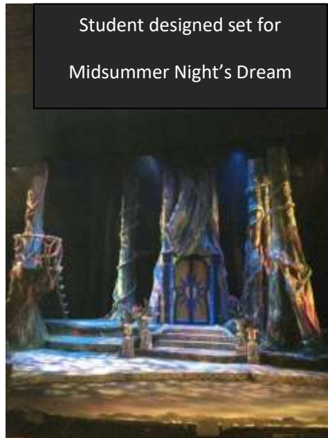
Student designed set for Midsummer Night's Dream